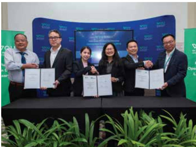
▲ Marking a new chapter of collaboration.

Wawasan Open University (WOU) continues to build momentum in strengthening Penang's talent pipeline through a growing network of purposeful industry collaborations. Each partnership reflects a deliberate effort to address evolving skills needs across the state's high-tech sectors, translating industry demand into accredited academic and professional pathways that support workforce development at every level.