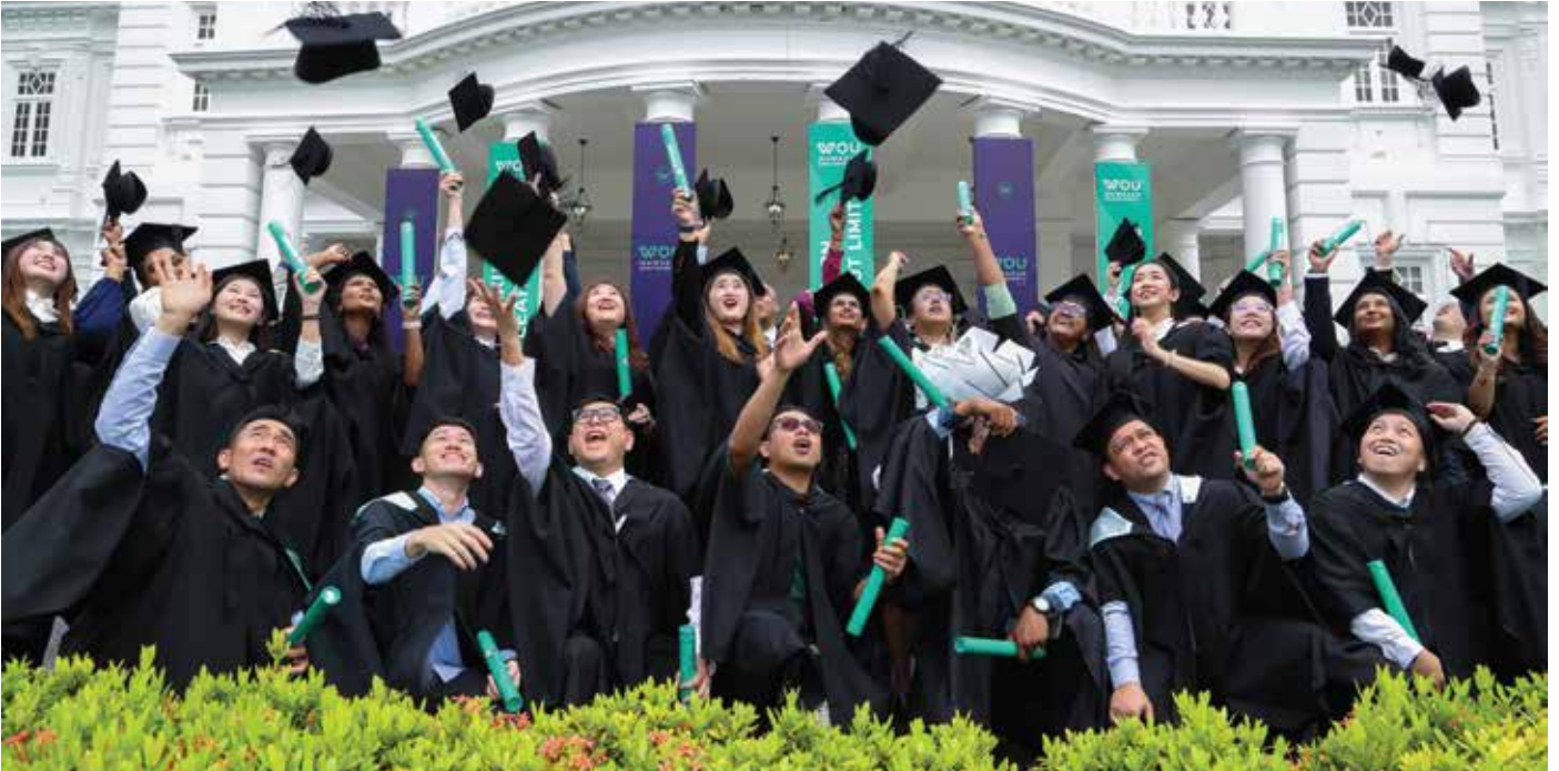
▲ Jubilant graduates celebrate their success.

750 Working Professionals Graduate at 16th Convocation