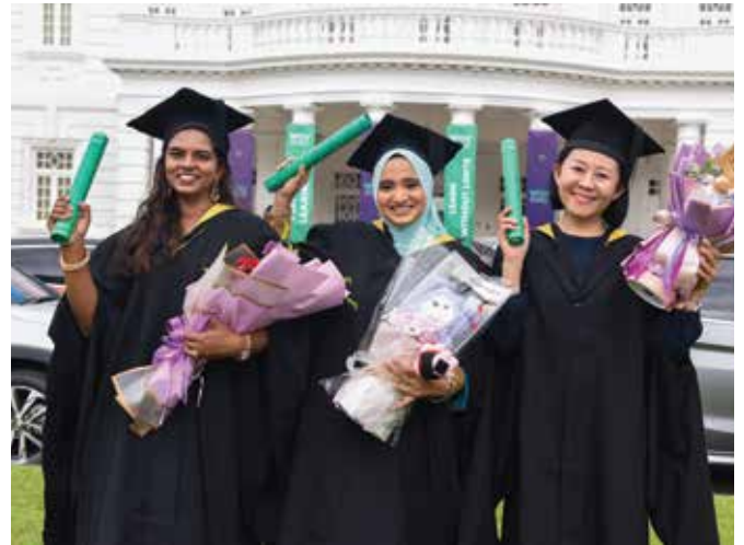
▲ A proud moment for our graduates.

Newly installed Pro-Chancellor Tan Sri Dato' Chang Ko Youn highlighted the importance of adaptability and cultural intelligence alongside technical skills. "Knowledge alone is not enough. What sets you apart is the ability to evolve, to work across cultures, and to connect with different perspectives. Today's economy values adaptability and cultural intelligence as much as technical skills. This combination will allow Malaysia to keep progressing," he said.