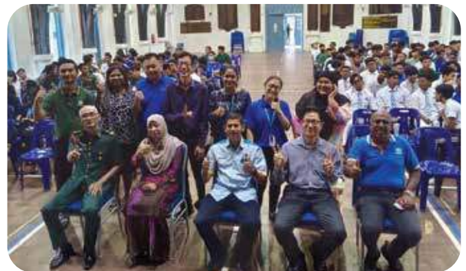
▲ Discover WOU @ Penang Free School ends with wonderful memories.

The event was a resounding success, demonstrating WOU's commitment to providing accessible and innovative education options for students. The positive response from the PFS students is a testament to the growing interest in WOU's programmes and the university's reputation for quality education.