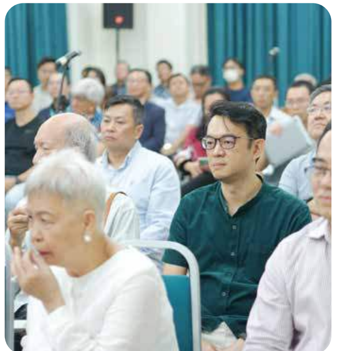
▲ Some attendees at the event.