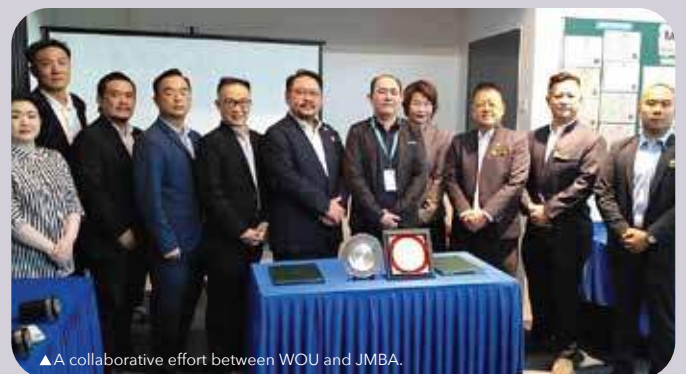
▲ A collaborative effort between WOU and JMBA.

Beyond academic pursuits, the partnership will encourage professional development through workshops, seminars and industry conferences, providing JMBA members with valuable knowledge and networking opportunities. This partnership between WOU and JMBA marks a significant milestone in the university's efforts to strengthen its ties with the industry and provide meaningful education to the community.