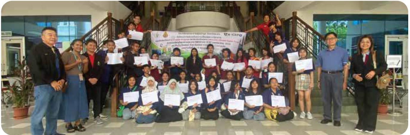
▲ Making memories and gaining knowledge at WOU.

Thirty-six Thai secondary school students from Kanarasdornbumroong School, Yala, recently participated in a two-day English language workshop at WOU Main Campus on 4 to 5 July 2024. The workshop, organised by the School of Education, Humanities, and Social Sciences (SEHS), aimed to enhance the students' English language skills through interactive activities and real-world examples.