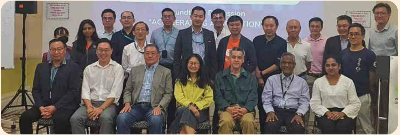
▲ Industry leaders and WOU academics at the roundtable discussion on accelerating AI adoption.

Academics play a crucial role in developing and enhancing artificial intelligence (AI) algorithms, while industry leaders focus on implementing these advancements within the industrial ecosystem.