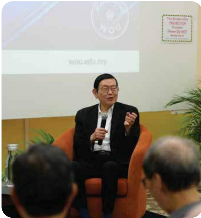
▲ Dr Richard Chang

Continuing with the #Conversations@WOU industry engagement efforts, WOU hosted an exclusive dialogue featuring Dr Richard Chang Ru-gin, the “Godfather of China’s Semicon Industry” on 17 August 2024 at The Hall, Homestead.